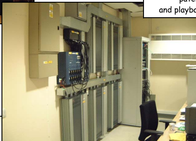
The control room has five 24 channel dimmers , house lighting dimmer, Strand 300 desk and both audio visual patching and playback racks.