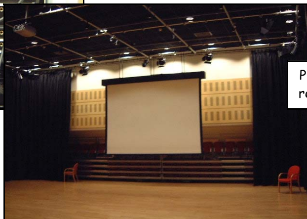
Projection screen & retractable seating.