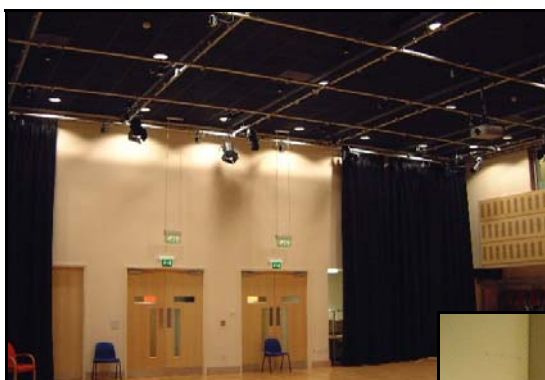
18 internally wired bars form the lighting grid.

Whatever the size of project, (even if it is only in the planning stage), for further information or to arrange a free site visit , please contact our Sales team.